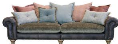
GRAND SPLIT SOFA

A romantic roll armed collection, designed for snuggling up in the cosiest of rooms with a literary classic and a huge cup of steaming tea. Heritage inspired herringbones and English wools are hugged by comforting soft leather arms in artistic burnt umber and rich sienna shades.