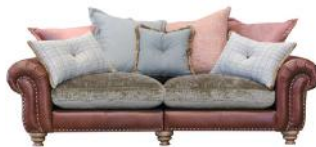
LARGE SPLIT SOFA

SHOWN IN OPTION 1 FABRIC COLLECTION WITH BOUND TAN BOY LEATHER