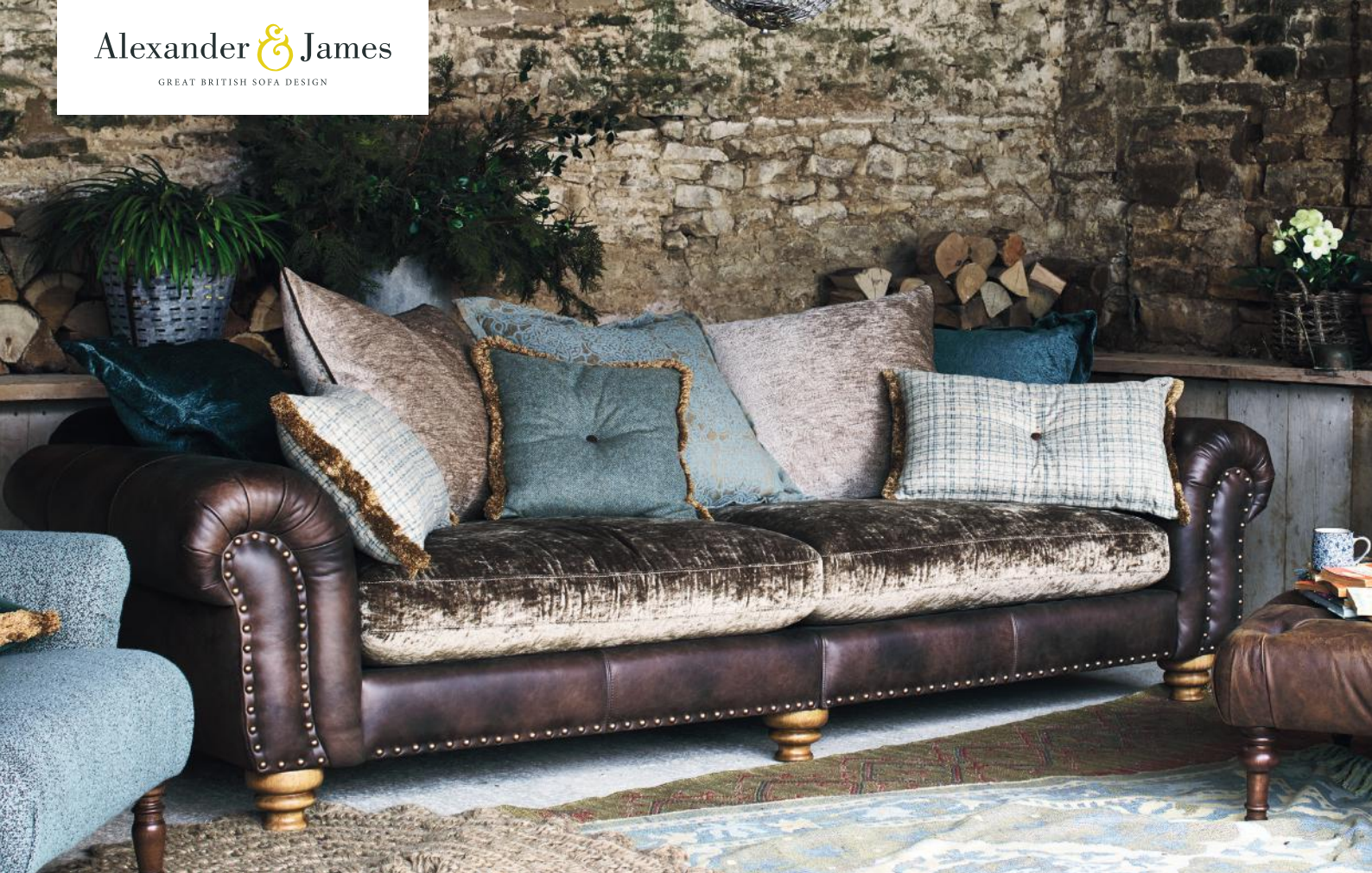
BLOOMSBURY GRAND SPLIT SOFA SHOWN IN CAL SMOKE LEATHER WITH FABRIC OPTION 2 AND WEATHERED OAK FEET

Alexander & James GREAT BRITISH SOFA DESIGN