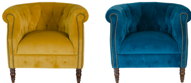
SHOWN IN PLUSH TURMERIC