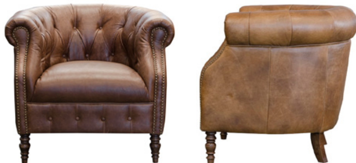
SHOWN IN CAL TAN

This chair has all the curves you can handle. Lavish jewel colours or natural vintage leathers, it's as cute as a button. Available in a variety of fabrics and leathers.