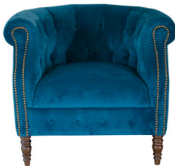
SHOWN IN PLUSH MALLARD