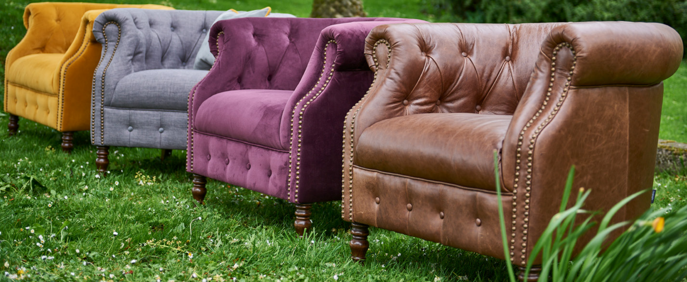
JUDE CHAIRS FROM LEFT TO RIGHT IN PLUSH TURMERIC, COCOON SILVER, PLUSH BRINJAL & CAL TAN, ALL WITH DARK WOOD FEET

Alexander & James GREAT BRITISH SOFA DESIGN